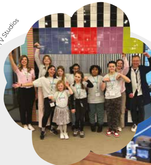
Good Morning Britain TV Studios