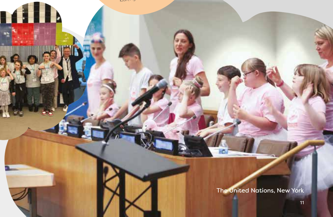
The United Nations, New York