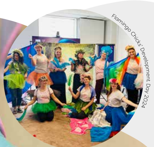
Flamingo Chicks Development Day 2024