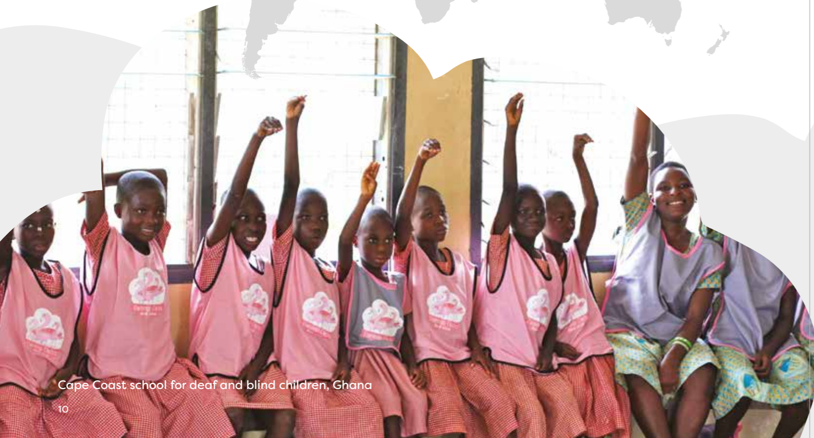
Cape Coast school for deaf and blind children, Ghana