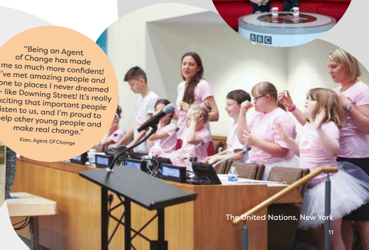
The United Nations, New York